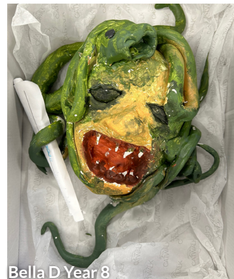
Bella D Year 8