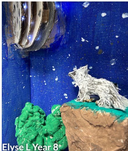
Elyse L Year 8